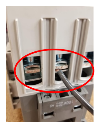
Figure 1: Picture of box lug